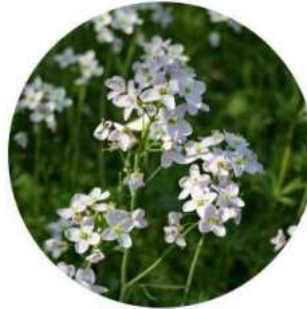
Wildflowers of the month: Lady's Smock/ Cuckoo: 17 th