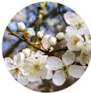
Blackthorn: 11 th – 14 th

I have shared some of my favourite Spring finds with you below – see what you can see little oaks! And remember to breath in that fresh spring air, lie down in a meadow and look up at the blue skies, and to smell in all the scents all around you. It is truly a magical time of year.