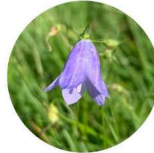
Harebell: 23 rd